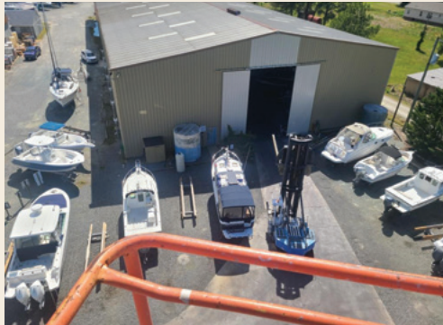
DYC HI-DRI BOATEL