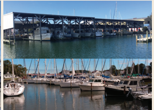
DYC SLIPS (COVERED & UNCOVERED)