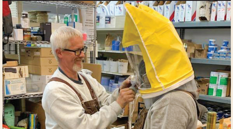
DYC TECHS' RESPIRATOR FIT TEST