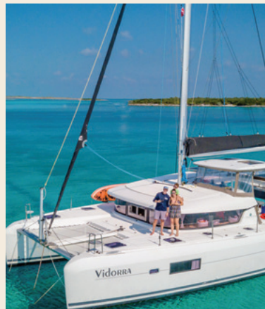
VANDERBILT FAMILY EXPLORES EKUMAS ABOARD S/V, 'VIDORRA'