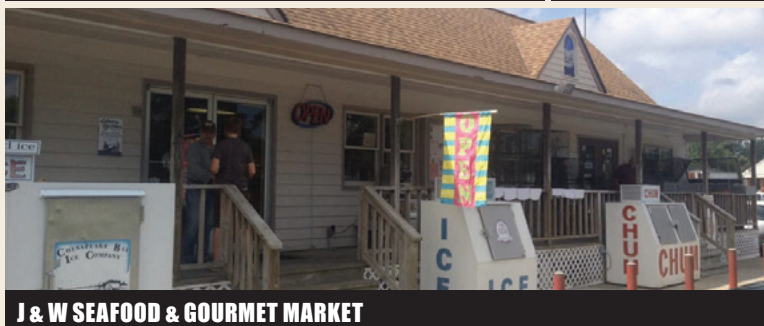
J & W SEAFOOD & GOURMET MARKET