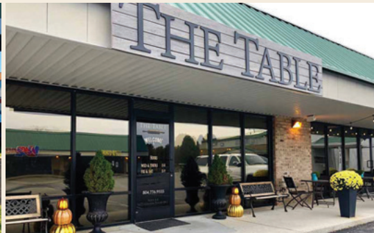
THE TABLE- FARM TO TABLE & ICE CREAM