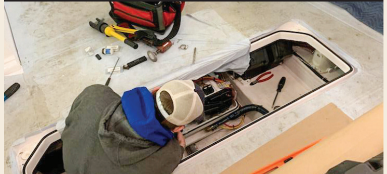
TRUE NORTH 340E GENERATOR INSTALL