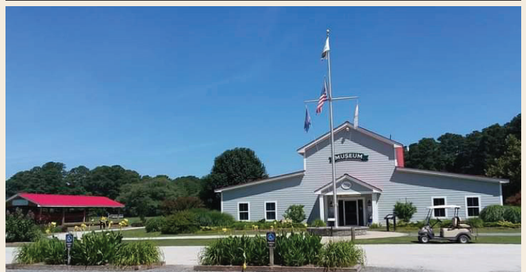
DELTAVILLE MARITIME MUSEUM & HOLLY POINT NATURE PARK GIFT SHOP & CONCERTS