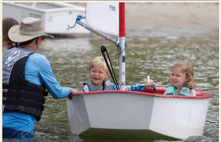
FISHING BAY YACHT CLUB- JUNIOR SAILING CLASSES, FAMILY EVENTS & REGATTAS