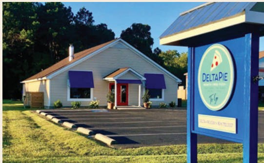
DELTA PIE- PIZZA & MORE