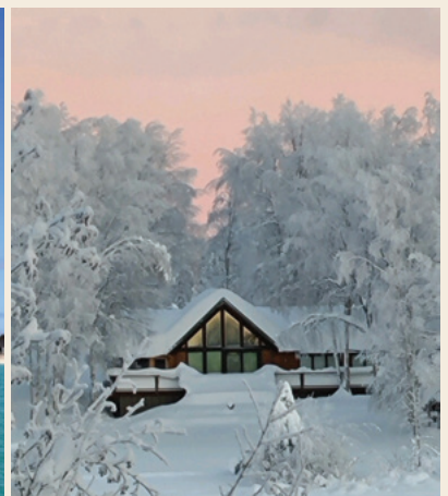
ALASKA HOME- MILLERS S/V 'GOOD LUCK' WILLOW, AK