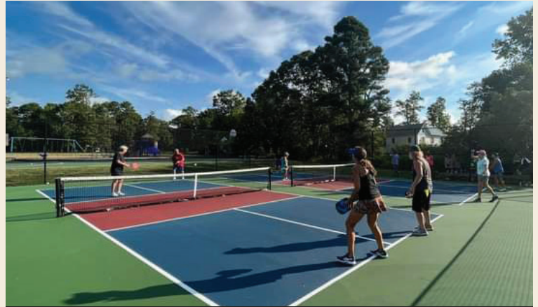
DELTAVILLE COMMUNITY ASSOCIATION- EVENT VENUE, PICKLEBALL, TENNIS, POOL & PLAY AREA