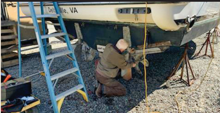
MAXUM 41 SHAFT/COUPLING WORK