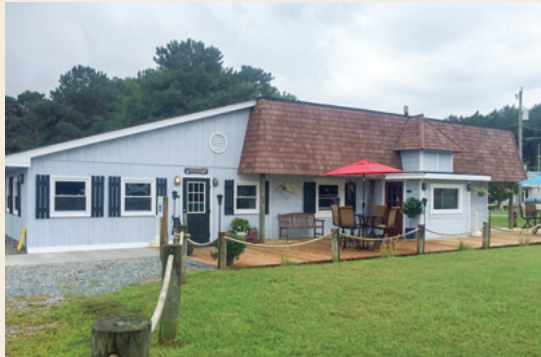
THE GALLEY- BAR & GRILL