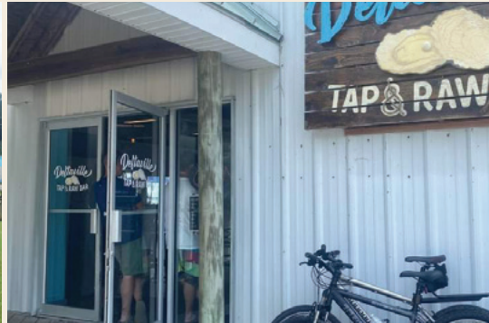
DELTAVILLE TAP & RAW BAR