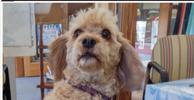
Faces of Boating