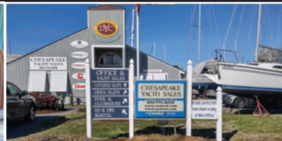
Boat Lover's Day