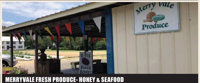
MERRYVALE FRESH PRODUCE- HONEY & SEAFOOD