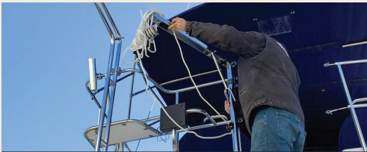
CATALINA 445 DINGHY DAVIT & ENGINE HOIST INSTALL