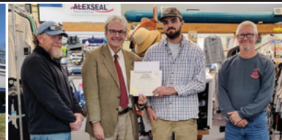
Service Department News