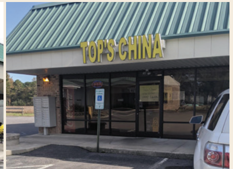
TOP CHINA- TAKE OUT