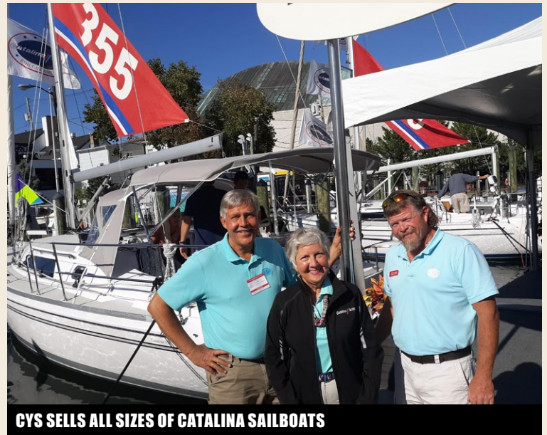
CYS SELLS ALL SIZES OF CATALINA SAILBOATS