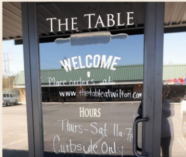
THE TABLE – FARM TO TABLE FOOD & TEMPTING BAKERY