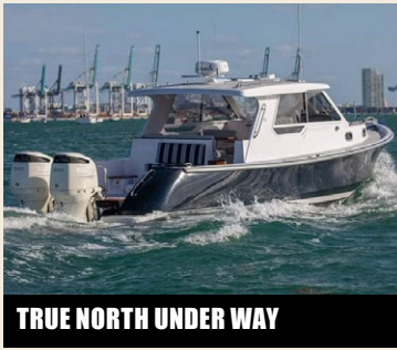
TRUE NORTH UNDER WAY