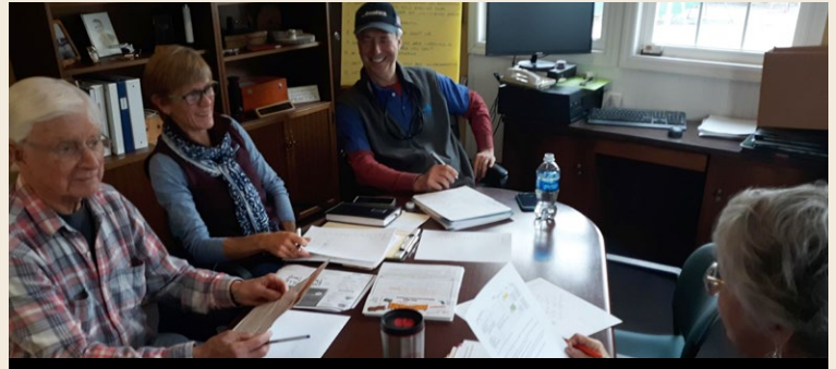
DEALERS PLAN 13TH ANNUAL DEALER DAYS BOAT SHOW (PHOTO TAKEN BEFORE SOCIAL DISTANCING!)