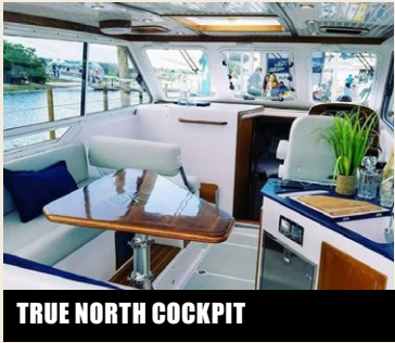
TRUE NORTH COCKPIT