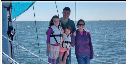
Faces of Boating