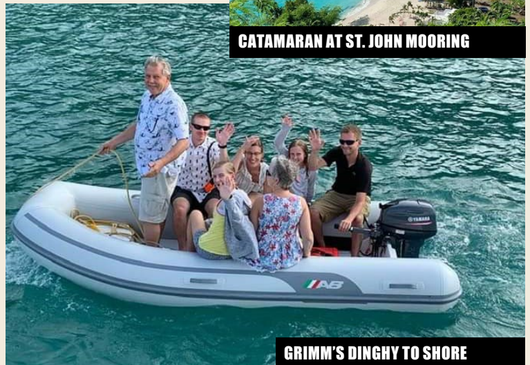
GRIMM'S DINGHY TO SHORE