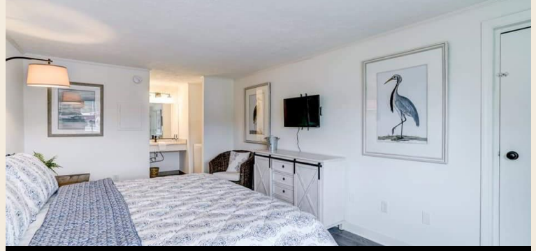
DOCKSIDE INN ROOMS HAVE BEEN GIVEN A REFRESHING FACE-LIFT

For more info check out www.deltavilleva.com or email us at info@dycboat.com . ↓