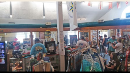
BOATERS ENJOYING DEALER DAYS FUN

Spread the word! Deltaville Dealer Days Boat Show, October 24 & 25, 2020 is the time to shop both new and used boats in Deltaville, The Boating Capital of The Chesapeake. Each year this event gets bigger and better. Chesapeake Yacht Sales is one of the 5 local new boat dealers (power & sail) who participate in this annual boat show. Visit each of the dealerships for food, doorprize registration and fun boat shopping. Boats will be on display and dealers will welcome you with special deals.