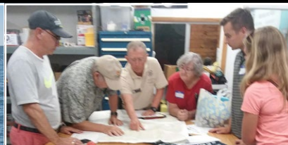
Boaters' Boot Camp Rescheduled