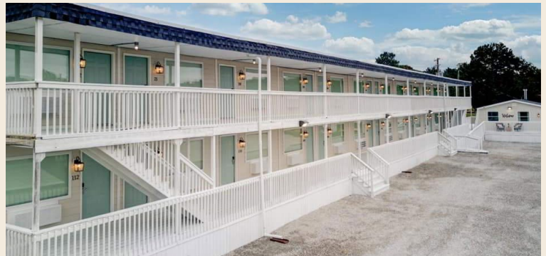
DOCKSIDE INN HAS BEEN RENOVATED AND IS OPEN FOR BUSINESS