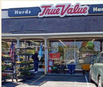
HURD'S TRUE VALUE – HARDWARE DOESN'T SAY IT ALL....