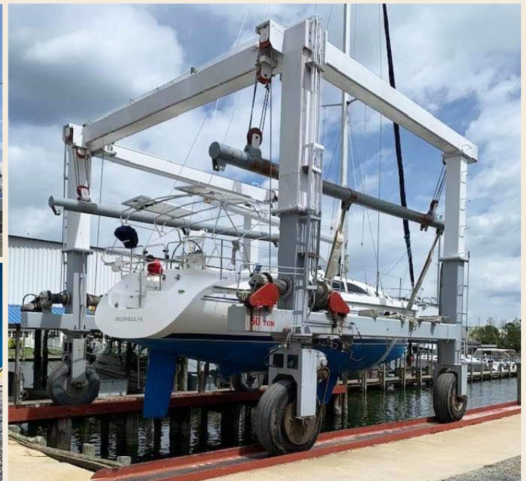
YOUR DYC SERVICE TEAM MAKING REPAIRS AND UPGRADES WHILE STAYING ON SCHEDULE