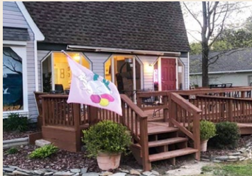
CAFÉ BY THE BAY – COFFEES, TEAS & MORE

Under strict Covid 19 Guidelines and careful rulings by Middlesex County, the little village of Deltaville has cared for the essential needs of the community. All businesses who were able to remain open have learned how to keep their clients and team members safe from the spread of virus. It is impossible to mention all the community effort of businesses, churches and residents. However, please allow us to give a shout out to these 4 small businesses that make life better in Deltaville, VA. ↓