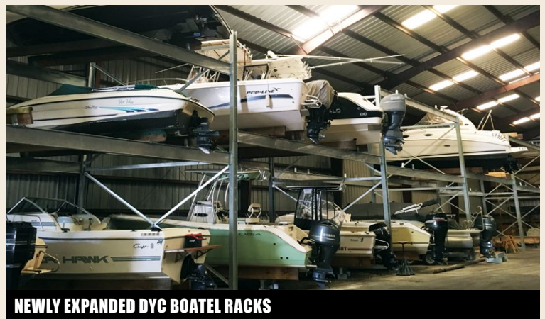
NEWLY EXPANDED DYC BOATEL RACKS