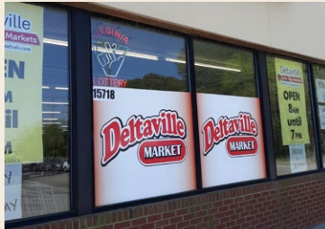
DELTAVILLE MARKET – GROCERIES FROM FOLKS WHO CARE