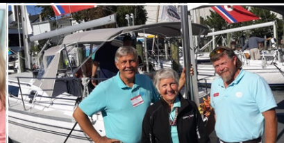
August is Catalina Month