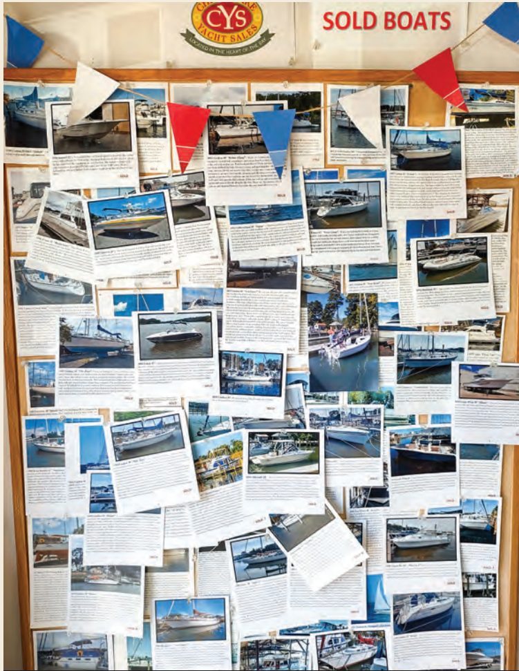
SOLD BOAT BULLETIN BOARD

You can tell from the SOLD BOATS bulletin board inside CYS office, that boat sales have been busy. There are mixed feelings whenever a boater parts with a vessel. However, the new owner is always smiling! ↓