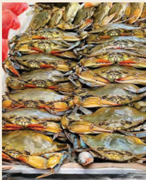
FRESH SEAFOOD & TAKE OUT AT J & W SEAFOOD