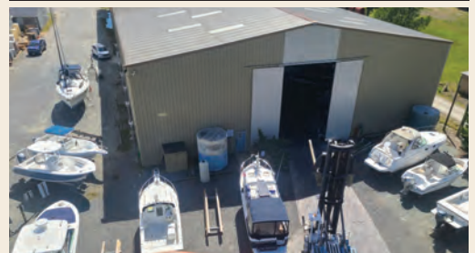
DYC BOATEL ENTRANCE