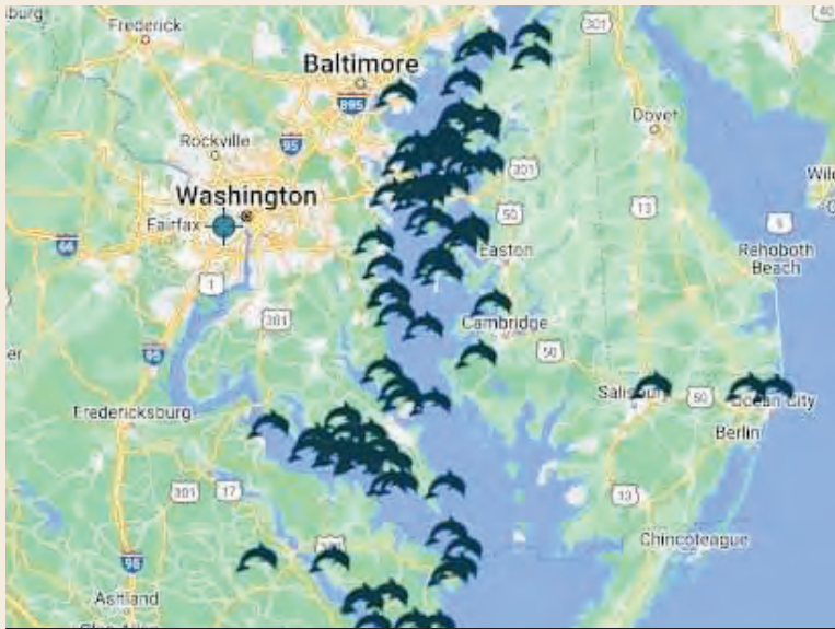
DOLPHIN SIGHTINGS ALONG COAST