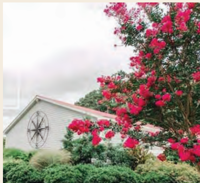
CONCERTS, DISPLAYS & SEMINARS AT DELTAVILLE MARITIME MUSEUM