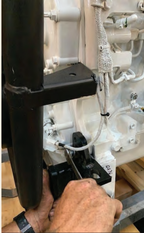
NEW ENGINE INSTALLATION