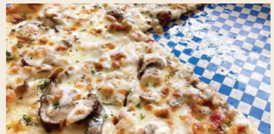
PIZZA AT DELTA PIE