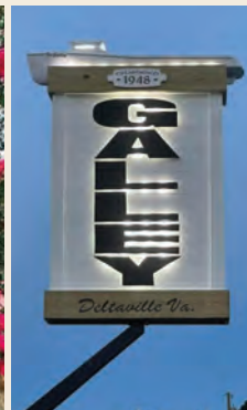
THE GALLEY GETS A NEW SIGN