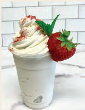
ICE CREAM AT THE TABLE & CAFÉ BY THE BAY