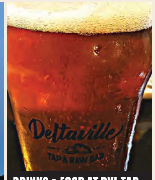
DRINKS & FOOD AT DVL TAP & RAW BAR THE GALLEY & THE TABLE