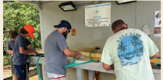
FISH CLEANING FUN