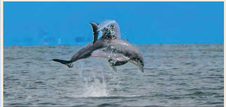
DOLPHINS AT PLAY NEAR DELTAVILLE