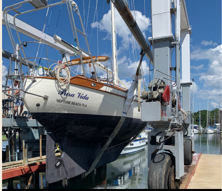
RICHARDSON S/V 'PURA VIDA' LAUNCHED AFTER 15 YEAR REFIT