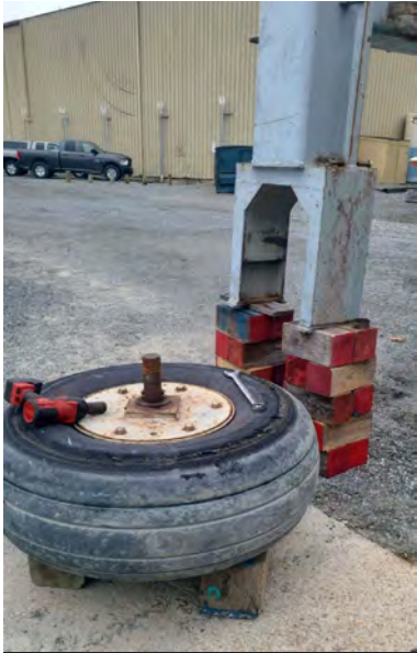
DYC FORKLIFTS & TRAVEL LIFT GET SOME LOVE