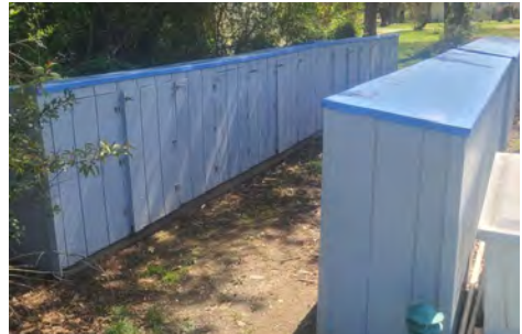
REBUILT DOCK LOCKERS FOR SPECIFIC SLIPS