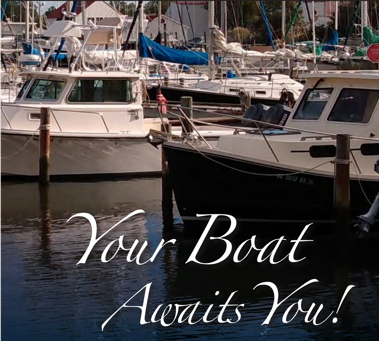
Shop Boaters Boutique @ DYC