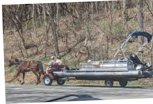
Nearby Boaters Start the Season