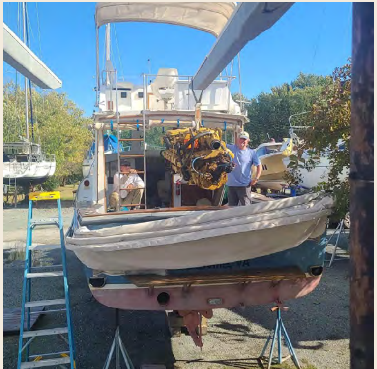
REMOVE ENGINE FOR REBUILD