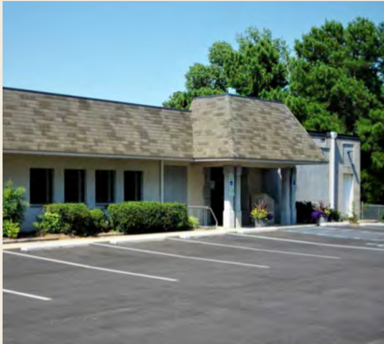
DELTAVILLE PUBLIC LIBRARY, 35 LOVERS LANE, DELTAVILLE, VA.

Deltaville Maritime Museum will have a Car Show on Saturday, May 7th and a Groovin' Concert outside on Saturday evening. ↓