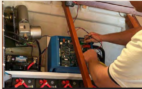
VICTRON BATTERY CHARGER & BATTERY INSTALL

Contact Laura Powell 804-776-9898 or laura@dycboat.com if we can help you get your boat ready. ↓