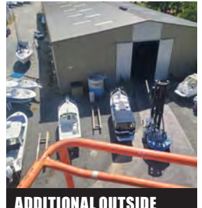
ADDITIONAL OUTSIDE BOATEL RACKS