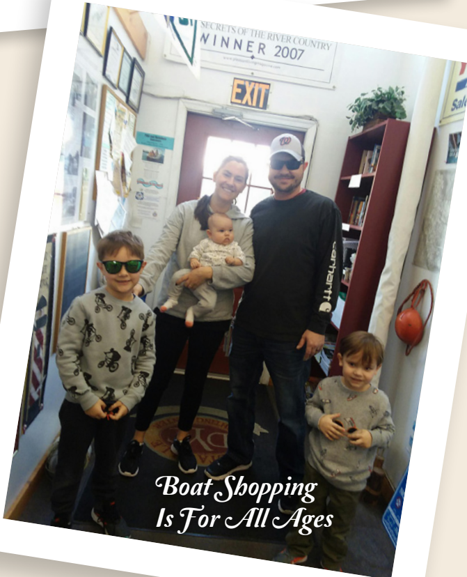
Boat Shopping Is For All Ages