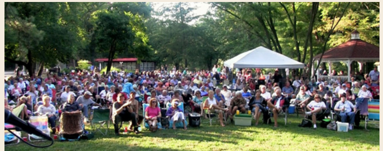
EVERYONE LOVES THESE TIMES

Visit the park and gardens, walk the waterfront, enjoy the nature trails 365 days a year from dawn to dusk- at The Deltaville Maritime Museum and Holly Point Nature Park. The museum is open daily and there are many outside exhibits in the park. Feel free to enjoy the handy benches and picnic tables. Every 4th Saturday from May through September, the museum offers Holly Point Farmers Market from 9 am to 1pm and Groovin' in the Park in the evening. Food concessions during events.