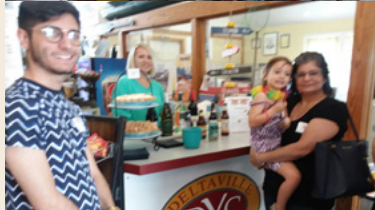
TASTE THE GOOD LIFE OF BOATING IN DELTAVILLE

Come join the fun in Deltaville on Saturday, May 4th and Sunday, May 5th, 10 am to 4 pm for Deltaville Dealer Days Boat Show. The 12th annual DDD has become a community event with fun all around Deltaville village.