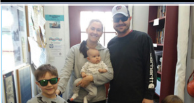
Faces of Boating