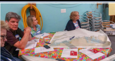
Boaters' Boot Camp @ DYC