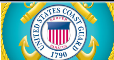
Free Vessel Safety Inspections @ DYC