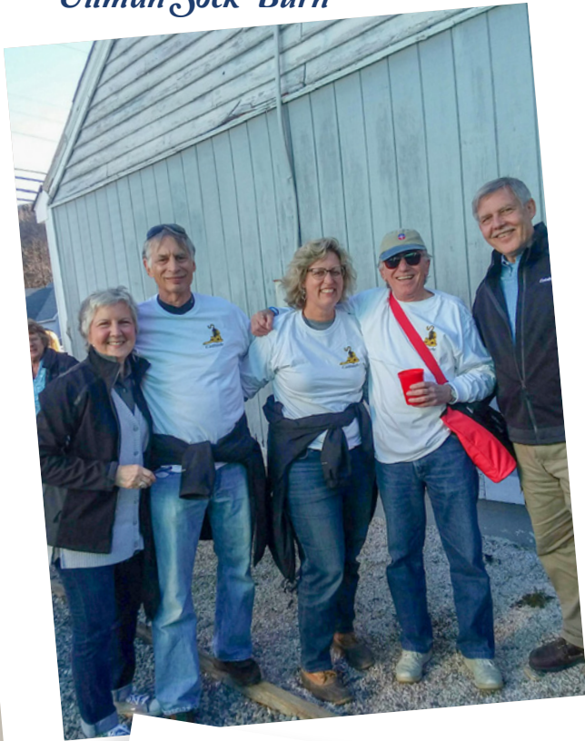
Grimms with 'Catitude', crew at Ullman Sock Burn