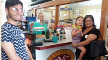
TASTE THE GOOD LIFE OF BOATING IN DELTAVILLE

Come join the fun in Deltaville on Saturday, May 4th and Sunday, May 5th, 10 am to 4 pm for Deltaville Dealer Days Boat Show. The 12th annual DDD has become a community event with fun all around Deltaville village.